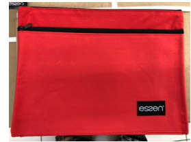
Canvas zip file All students: Red Muslim: Also blue & green