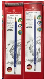
HB #2 Pencils with erasers