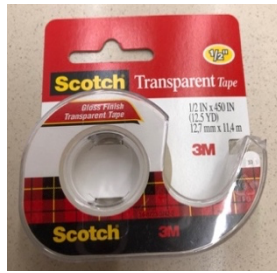
Roll of tape