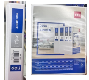
1 inch and 1.5 inch 4-ring binder with clear pocket front