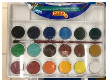
Watercolors with brush