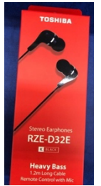
In-ear phones (Gr. 3-5)