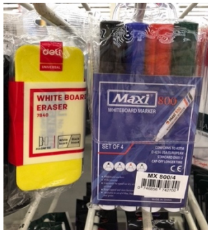
White Board markers and eraser