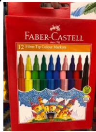
Faber-Castell Washable Markers