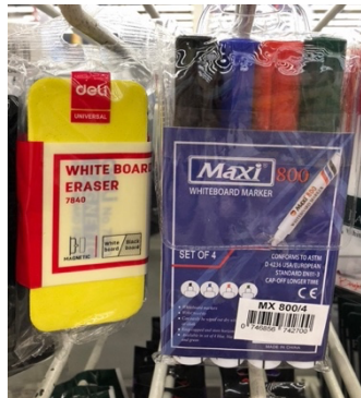
White Board markers and eraser