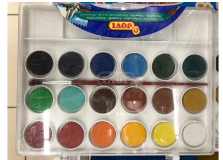
Watercolors with paint