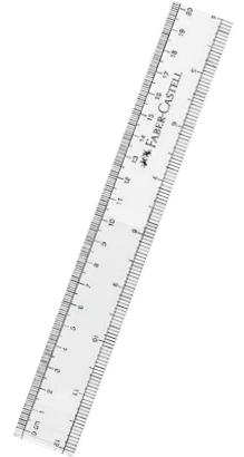
Ruler – 30 cm (Gr 4-5)