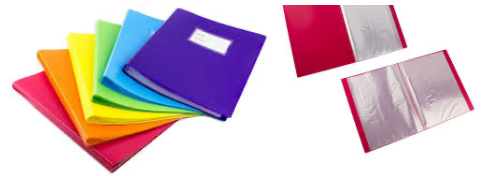
A4 presentation display book w/clear sleeves All students: Red Muslim: Also blue & green