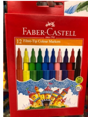
Faber-Castell Washable Markers