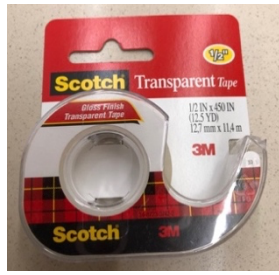
Roll of tape