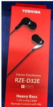
In-ear phones (Gr. 3-5)