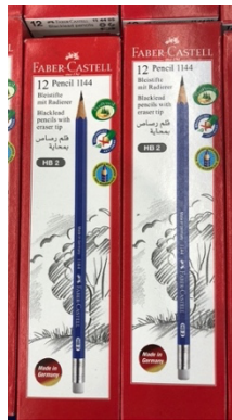
Pencils with erasers